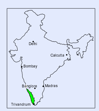
Figure 1. This is an inserted EPS graphic