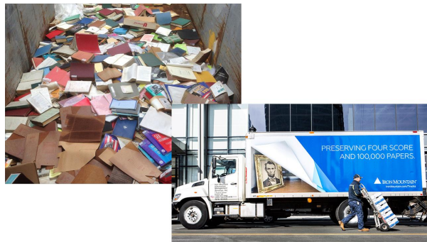
Figure 1: Sights we have seen all too often.