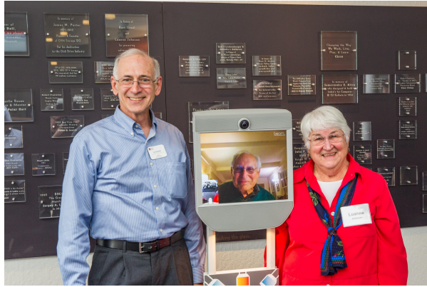
Figure 3: Len Shustek, Chairman of the Computer History Museum, presenting an Achievement award to Burt Grad (remotely in the Beam robot) and Luanne Johnson in March 2017 — photo credit to ©Douglas Fairbairn Photography. (Photo used with permission of the individuals in the picture.)

The third person in the image is Len Shustek, who founded the Computer History Museum — another example of an individual who is not a professional historian but who has had a major effect on the world of computing history (the CHM founding is described at tug.org/1/shustek-museum ).