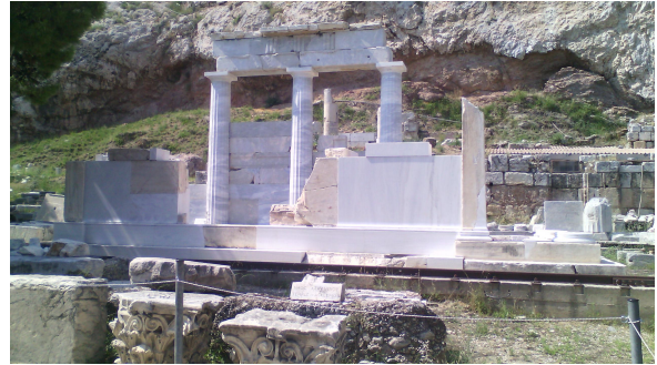
Figure 4: The partially restored temple as it stands today.

All extended characters have several heights.