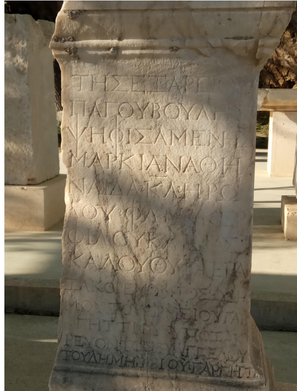
Figure 1: The pedestal NK14 from the archaeological site of the Athens Parthenon.

the word "ΔΙΔΑΣΚΑΛΟΥ" (=teacher), and Ε=Τ+Ε in the word "ΘΥΓΑΤΕΡΑ" (=daughter). The letters Φ and Ψ dramatically extend below the baseline and above the capital X-height. The letter Ζ is the letter Zeta (crossing it becomes a Ξ, Xi). The symbol ς is an ornament. The inscription also contains many alternative characters that we will discuss below.