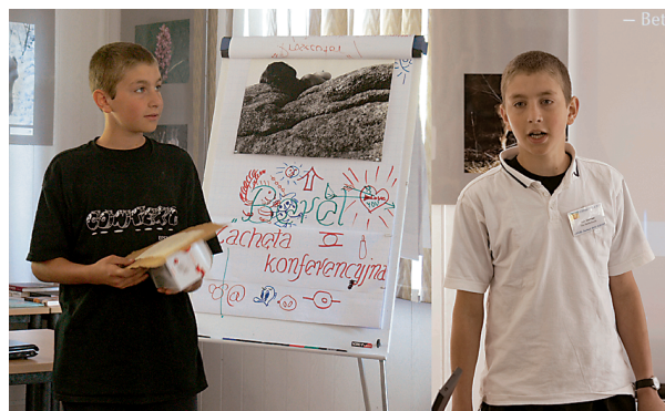
Figure 3: Left: with the diploma; right: self-confident